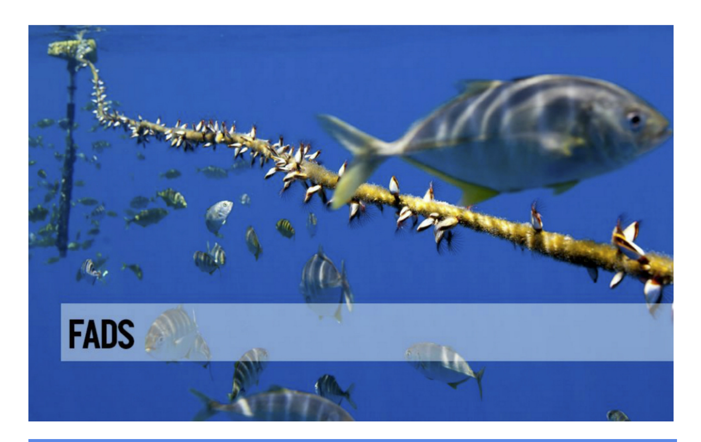
FADs - Greenpeace and Thai Union agree that the sustainable management of tuna stocks requires management and reduction of FADs in each fishery.