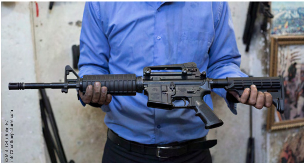
A Kurdish gunsmith holds a US-made M16A4, previously in the possession of the Iraqi army, and later IS, after the weapon was converted in to an M4 carbine-type rifle. Erbil, September 2014.

The main rifle type used by IS is the AK (Avtomat Kalashnikov) family of automatic rifles, as well as close copies and derivatives, with a bias towards the Russian and Chinese types that have been the staple of the Iraqi army for decades. Most of these weapons are decades old, though the more modern Russian AK-74M is in evidence, most probably looted from Syrian army stocks. IS forces have also captured US-manufactured small arms, including M16 assault rifles, along with Chinese, Croatian, Belgian and Austrian small arms. 9