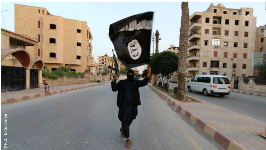
IS fighter waves the IS flag in al-Raqqa, Syria, June 2014.

After a brief summary of IS' formation and subsequent expansion, this chapter describes the arsenal of the armed group which has allowed it to maintain its control over parts of Iraq and Syria and commit crimes under international law.