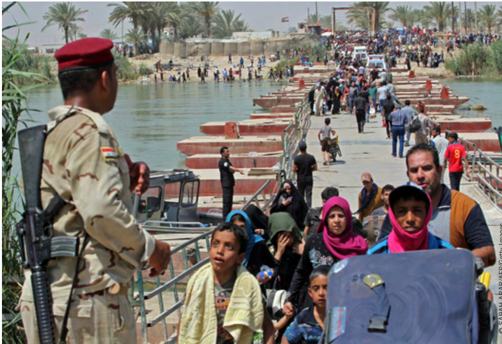
Residents from Ramadi, displaced by IS' capture of the city, wait to cross Bzeibez bridge on the southwestern frontier of Baghdad, May 2015.

entered Iraq with private security companies during the US occupation and found their way into Iraqi arms markets. 49