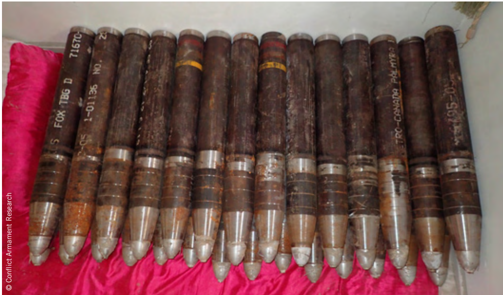
Improvised ground-to-ground rockets manufactured by IS forces and captured by Syrian Kurdish People's Protection Units in Kobane, documented by a Conflict Armament Research Field Investigation team on 21 February 2015 in Kobane.