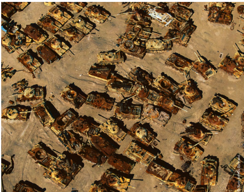
Iraqi tank junkyard in the desert near Al-Jahrah, Kuwait, January 1991.

President Hussein built up an indigenous arms industry, producing small arms and ammunition, modelled on the Russian AK series, Russian T-72 tanks under licence, howitzers, anti-tank grenade launchers (RPG-7) and Beretta-type pistols. According to Jane's Sentinel Security Assessment, by 1990 the country "was largely self sufficient in the production of small arms ammunition, rocket propelled grenades (RPG) [sic], mortar and artillery shells and aircraft bombs". 85