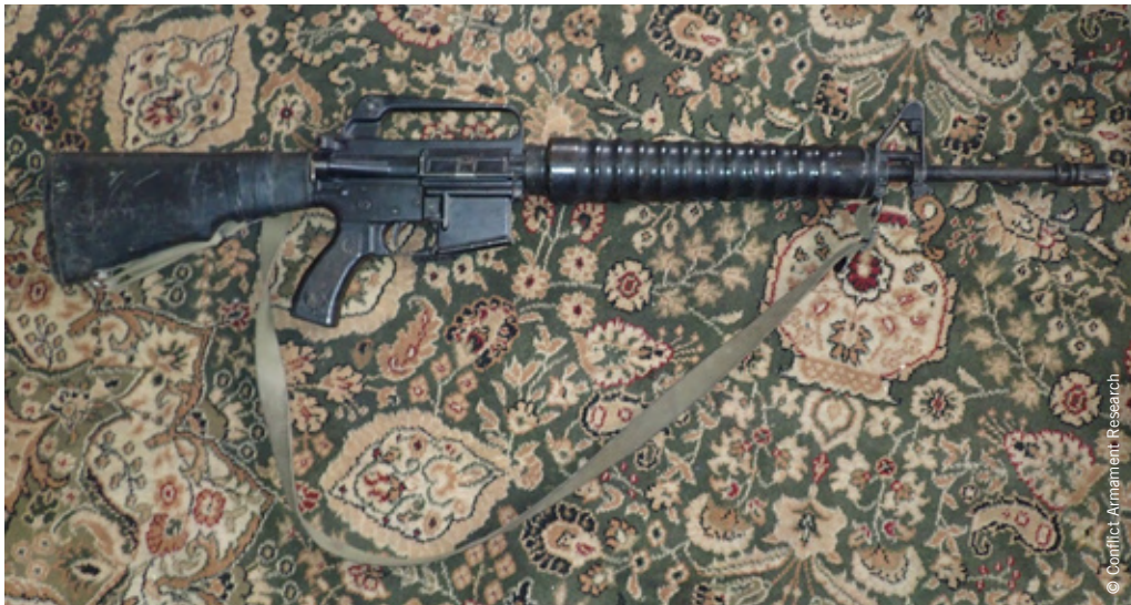
Chinese CQ 5.56mm rifle captured from IS forces by Syrian Kurdish People’s Protection Units during the siege of Kobane and documented by a Conflict Armament Research field investigation team on 24 February 2015 in Kobane.

In February 2015, Conflict Armament Research documented two Chinese CQ 5.56mm rifles which had been captured from IS fighters by Kurdish People’s Protection Units fighters. The rifles had had their serial numbers ground off and painted over with black paint; they were loaded with Chinese ammunition manufactured in 2008. Exactly the same configuration – from the removed serial numbers to the black paint and 2008 Chinese ammunition – had previously been observed by Conflict Armament Research and Small Arms Survey researchers in relation to Chinese CQ rifles identified in South Sudan among rebel forces in 2013. 66