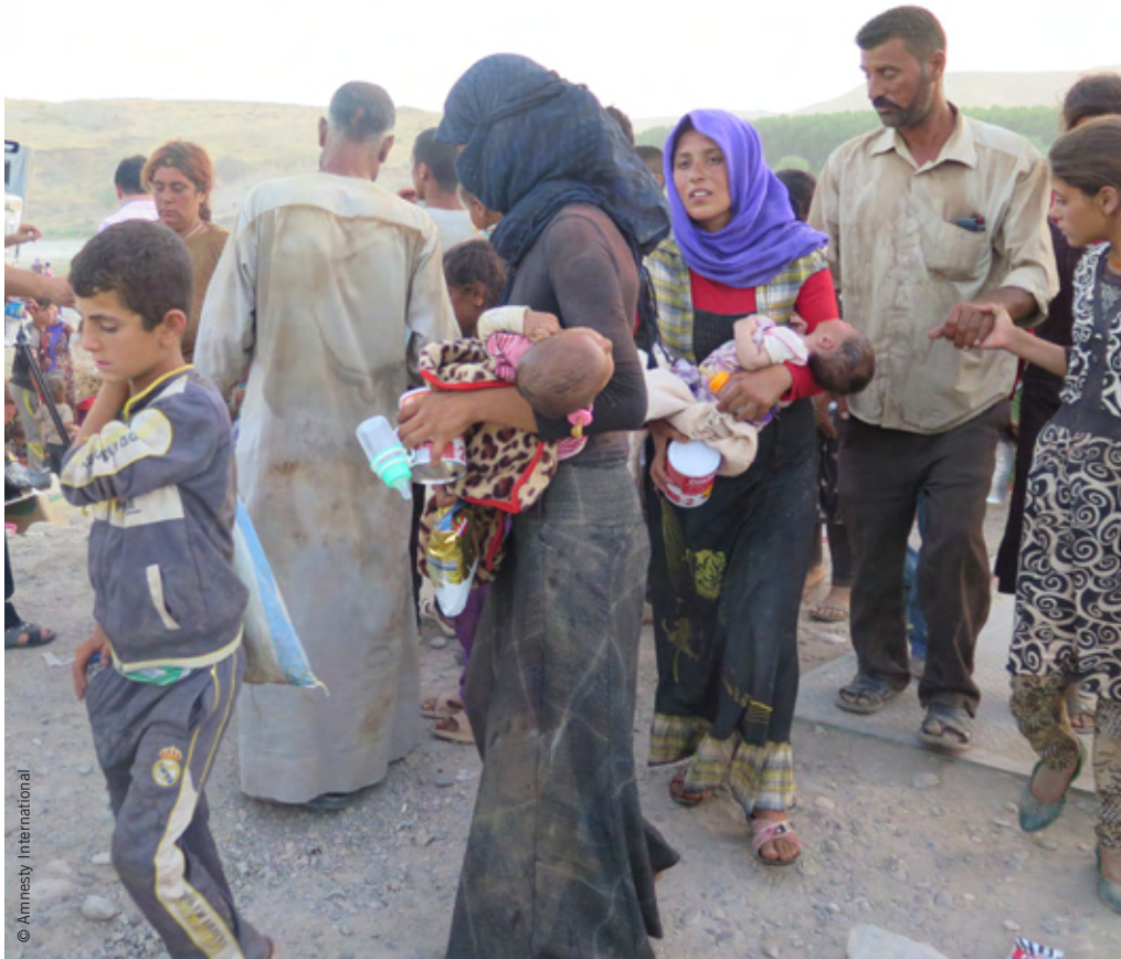
Yezidi internally displaced people arrive in Feshkhabour, Iraq, having fled Mount Sinjar after a week under siege from IS, August 2014

While much of the violence pitted Shi'a militias against Sunni armed groups, in 2008 Amnesty International reported further gross human rights abuses including the targeting of religious and ethnic minorities and others including "Yazidis, Christians, Sabeans and Palestinians... women, human rights defenders, judges, medical doctors and other professionals". 136 More recently, in 2014, Amnesty International documented Shi'a militia groups' systematic abductions and killings of Sunni civilians in Iraq, amounting to war crimes. The Shi'a militia groups were often armed and supported by the Iraqi military, and operating with their tacit support. 137