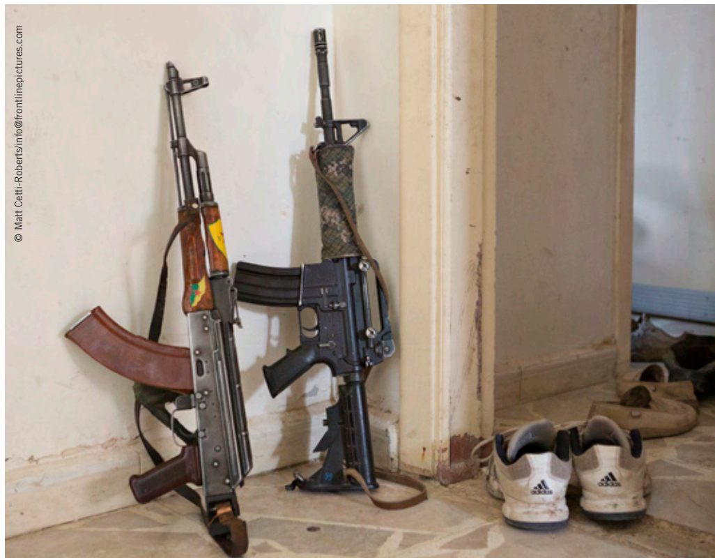
A Chinese-made Kalashnikov and an American M4 rifle (the latter captured from IS fighters) lean against a wall in a building occupied by Syrian Kurdish People's Protection Units fighters in Al-Yarubiyah, Syria, September 2014.