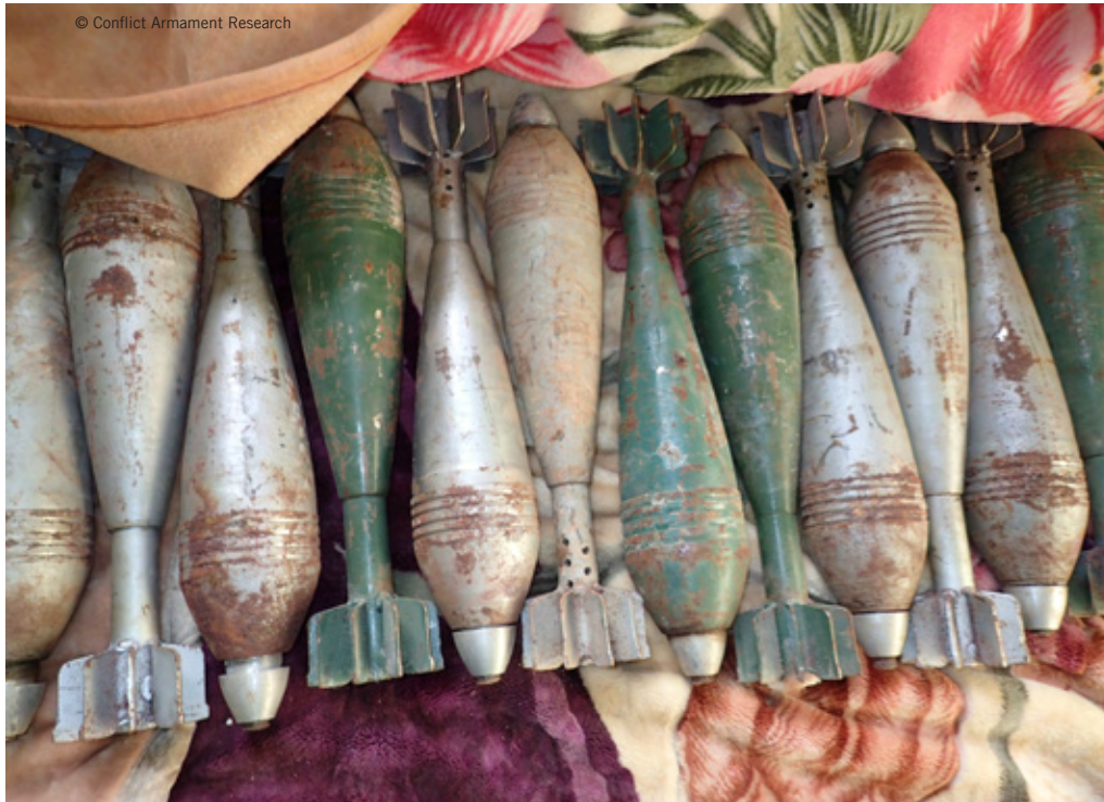
Improvised mortar rounds manufactured by IS forces and captured by Syrian Kurdish People's Protection Units documented by a Conflict Armament Research Field Investigation team on 21 February 2015 in Kobane.

IS captured an unknown quantity of 155mm M198 towed howitzers from Iraqi military stocks during its capture of Mosul in June 2014, along with the older Chinese Type 59-1, which the Iraqi army used extensively during the 1980-1988 Iran-Iraq war. 23 IS has also captured former Soviet Union D-30 and M-30 122mm howitzers from Syrian military stocks and small numbers of the older, and now obsolete, M-30 models which were probably taken from the Syrian army's reserve storage for deployment.